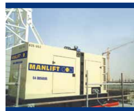
Construction Power Multiple Units

Manlift Power have supplied temporary power generators to a number of leading companies within the construction industry. Applications range from site office power, electricity to tower cranes, commissioning and testing purposes, piling/foundation work and temporary accommodation.