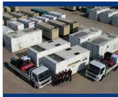
Service & Maintenance 24 Hrs, 7 Days per Week