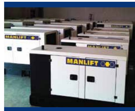
MLP Generator Sales 10kVA - 2000kVA