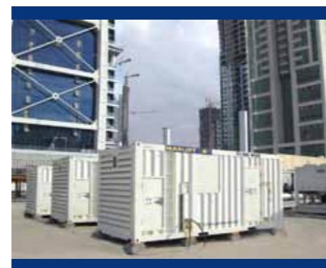
Temporary Cooling Plant 9MW @ 400V

Manlift Power can supply full turnkey installations for up to 5000 tons of temporary cooling. Large requirements are installed and commissioned quickly and efficiently to meet clients specific requirements.