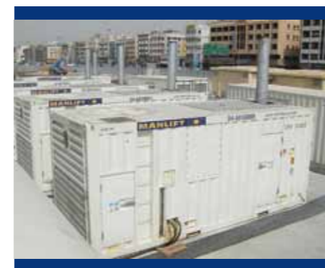
Tunnel Boring Machine (TBM) 5MW @ 11kV

Manlift Power can mobilise within hours of receiving order confirmation. Generators can be run 24 hours per day to provide power for tunnel boring machines (TBM's), quarrying plants or oil & gas rigs and other specialist applications.