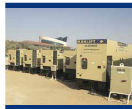
Concert Power Including on site support

Manlift power has supplied power solutions to prestigious events and concerts ranging from Celine Dion, to the FIFA football-club world cup and GP2 world superbike races.