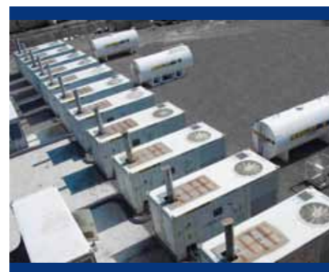
Processing Plant 11MW @ 6.6kV

Manlift Power specializes in the design, transport commissioning and on-site management of large power installations. When leased for long periods of time, Manlift deploy on-site technicians and forward operating workshops to facilitate routine operational maintenance.