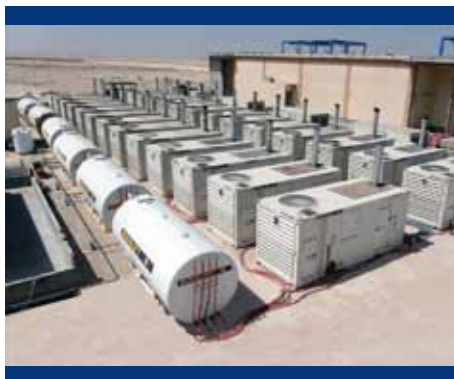
Cement Power Plant 27MW @ 6.6kV

Rental generator units are routinely serviced on site by Manlift Power's technician and engineering team. Manlift service staff are trained to EU standards. Extended after sales service contracts can also be purchased in conjunction with unit orders from MLP Generators.