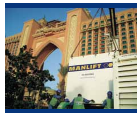
Rapid Response 6MW within 24hrs

EU qualified service Engineers on call 24 hours per day to provide support in times of crisis. Manlift power have supplied temporary power generators to a number of situations in the gulf region ranging from hotels to offices, factories and events.